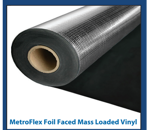
MetroFlex Foil Faced Mass Loaded Vinyl

MetroFlex FF Mass Loaded Vinyl Sound Barrier will not shrink, rot, or cause metal corrosion, and also features a strong resistance to adverse environmental conditions, oils, weak acids, and alkalis. MetroFlex FF MLV is used primarily on soundproofing HVAC ducts, piping, machinery, and exhausts. FF MLV is ideal for direct application to the noise source and/or to the housing covering the noise source.